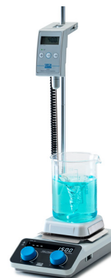
AREC 4 Digital System with VTF and Rod