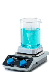
AREC 4 Digital