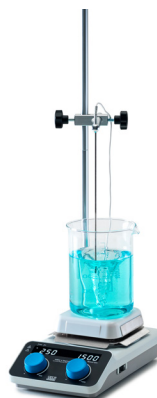
AREC 4 Digital System with Probe, Rod and Clamp