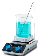
AREC 4 Digital System with Probe