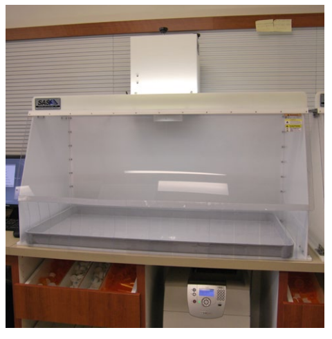
50" DCH provides a spacious workspace for pharmaceutical compounding