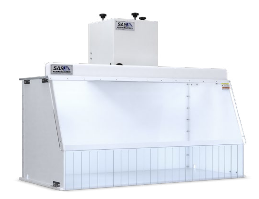
50" Ductless Fume Hood