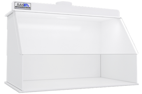
40" Acid Gas Fume Hood