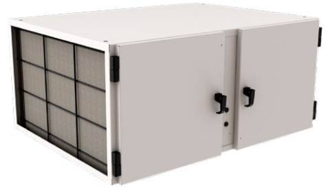
Model 700 Free-Hanging Air Cleaner

In addition to the Model 700, Sentry Air offers the Model 2000 Free Hanging Ambient Air Cleaner for industrial-strength filtration.