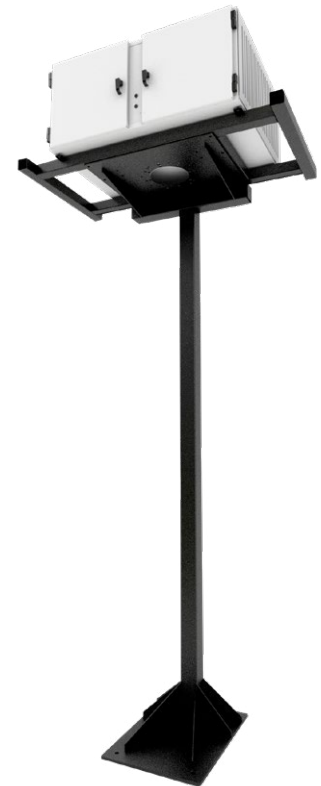
Model 700 shown on Fume Extractor Stand (above) and ceiling mounted (below).