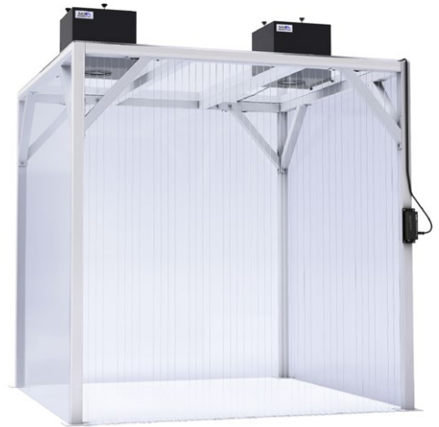
Custom Heavy-Duty Steel Frame Walk-in Hood with Dual Model 400 Air Cleaners