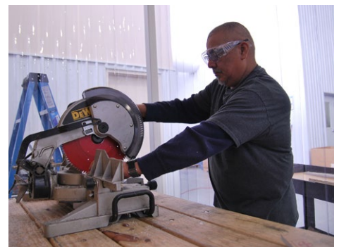
Applications such as grinding can be conducted under a Walk-in Hood.