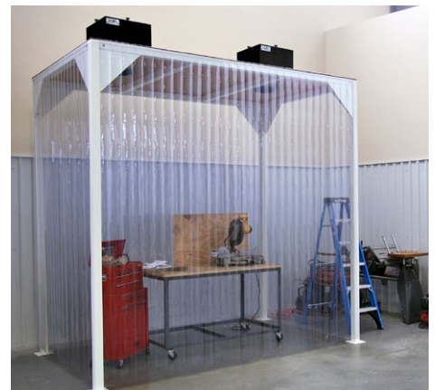
Walk-in Hoods allow for big machinery to be completely enclosed in order to capture airborne particulate and fumes.