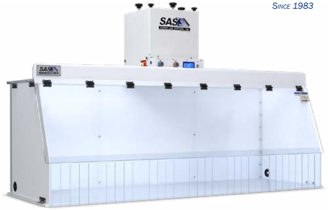
70" Ductless Fume Hood - Generation II

Generation II helps protect the operator and environment from hazardous fumes or particulate generated from applications performed within the hood. The new and improved design of this fume hood includes an adjustable light, variable speed fan control, and a digital display with an hour counter and digital magnehelic gauge. The adjustable light and fan controls enable the operator to make modifications suitable for the application. The digital hour counter shows the time the unit has been operated in hours to keep PM schedules for filter changes. The digital magnehelic gauge measures the static pressure on the filter in order to monitor the filter saturation. This unit also features an external reset button and programmable alerts.