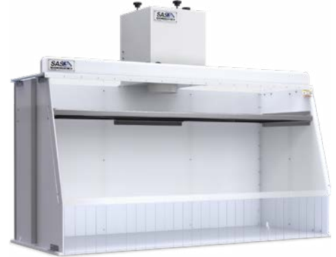
60" Ductless Spray Booth

The 60" Wide Ductless Spray Booth features energy efficiency, quiet operation, and low maintenance. Customized Spray Booths are also available for customers with specific application requirements.