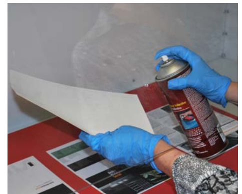
Close-up of operator safely spraying adhesive under a DSH.