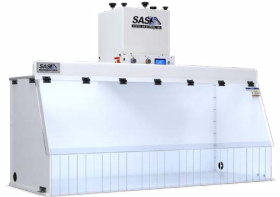
60" Ductless Fume Hood - Generation II

The 60" Wide Ductless Fume Hood – Generation II helps protect the operator and environment from hazardous fumes or particulate generated from applications performed within the hood. The new and improved design of this fume hood includes an adjustable light, variable speed fan control, and a digital display with an hour counter and digital magnehelic gauge. The adjustable light and fan controls enable the operator to make modifications suitable for the application. The digital hour counter shows the time the unit has been operated in hours to keep PM schedules for filter changes. The digital magnehelic gauge measures the static pressure on the filter in order to monitor the filter saturation. This unit also features an external reset button and programmable alerts.