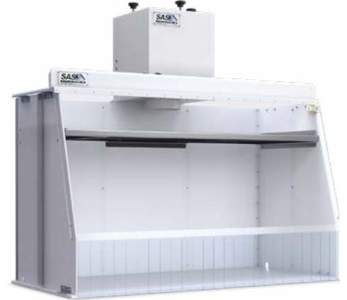
50" Ductless Spray Booth

The 50" Wide Ductless Spray Booth features energy efficiency, quiet operation, and low maintenance. Customized Spray Booths are also available for customers with specific application requirements.