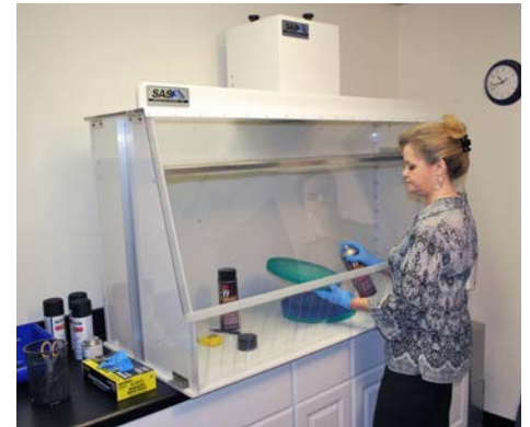
The Ductless Spray Booth provides fume control for a variety of aerosol spray application (60" pictured).