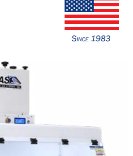
50" Ductless Fume Hood - Generation II

helps protect the operator and environment from hazardous fumes or particulate generated from applications performed within the hood. The new and improved design of this fume hood includes an adjustable light, variable speed fan control, and a digital display with an hour counter and digital magnehelic gauge. The adjustable light and fan controls enable the operator to make modifications suitable for the application. The digital hour counter shows the time the unit has been operated in hours to keep PM schedules for filter changes. The digital magnehelic gauge measures the static pressure on the filter in order to monitor the filter saturation. This unit also features an external reset button and programmable alerts.