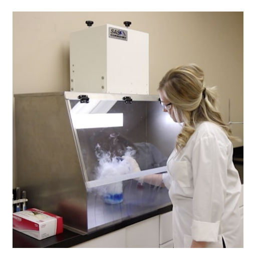
50" DCH provides fume control for various applications.