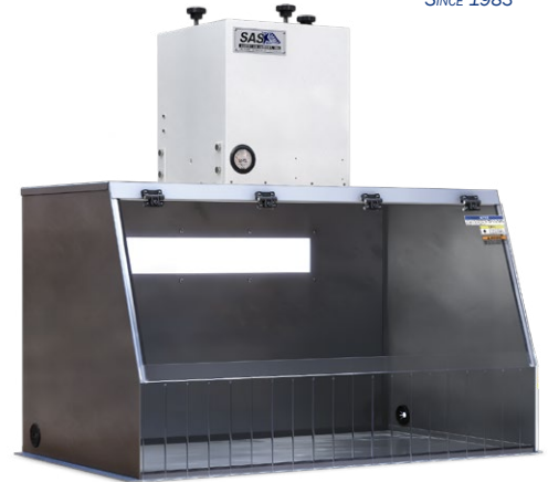
40" Stainless Ductless Fume Hood

Our line of ductless fume hoods is not intended for sterile compounding applications.