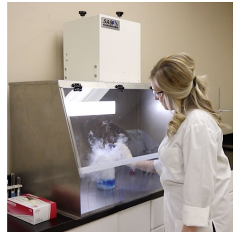
30" DCH provides fume control for a various applications.