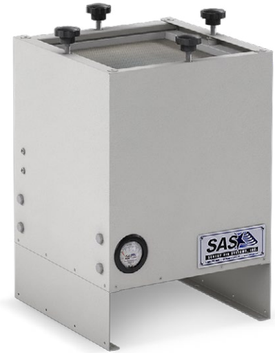
Model 300 Table Sentry

Sentry Air's Model 300 Table Sentry fume extractor can provide an energy-efficient, quiet and economical solution for many commercial, medical, laboratory and industrial applications. This unit is also available in a smaller model [SS-200-TS].