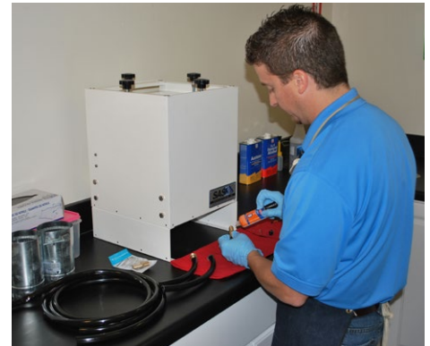
The Model 300 Table Sentry removes airborne fumes at the source for a variety of industrial, laboratory, and medical applications