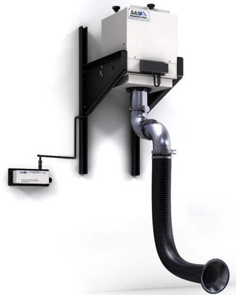
Model 300 Sky Sentry Fume Extractor