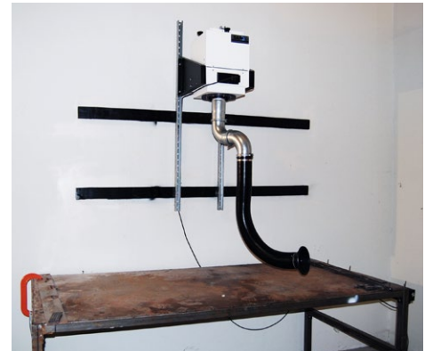
Model 300 Sky Sentry mounts on wall to free up needed benchtop space.