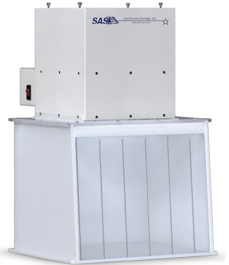
12" Mini Ductless Fume Hood

Our line of ductless fume hoods is not intended for sterile compounding applications.