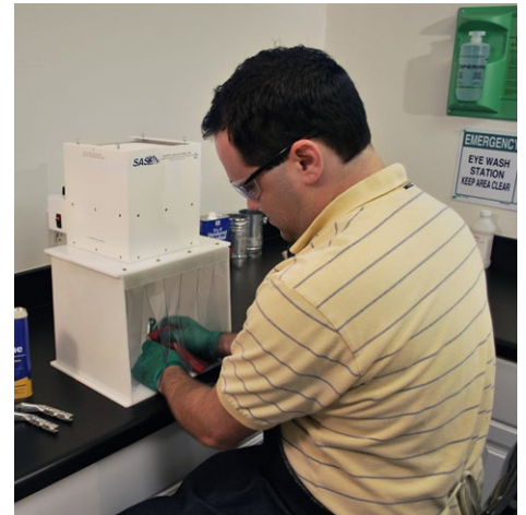
12" DCH provides a small workspace for many different applications.