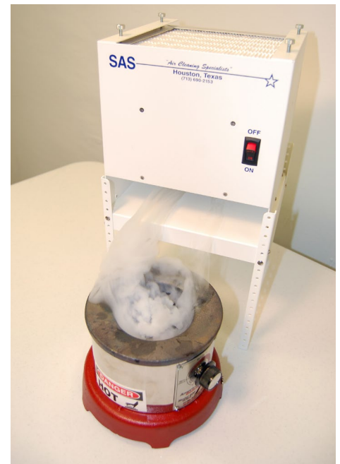
Model 125 Solder Pot Sentry drawing in fumes into the filtration system away from the operator.