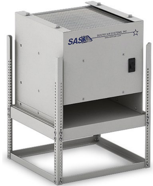
Model 125 Solder Pot Sentry

The Solder Pot Sentry offers an effective, quiet, and economical fume extraction solution for many benchtop soldering operations. All of Sentry Air's products are proudly manufactured in the United States.