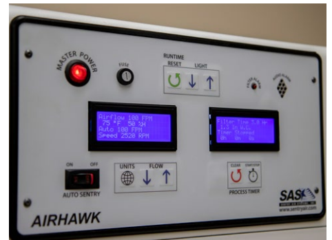
AirHawk's Advanced Control Panel