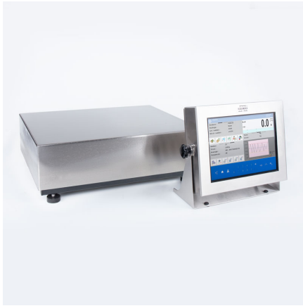
HY10.150.HRP.H High Resolution Scale

The drawings, photos and graphics used are for illustrative purposes only.