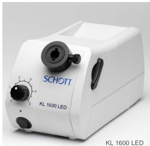
KL 1600 LED

A benchmark in the field of LED light sources