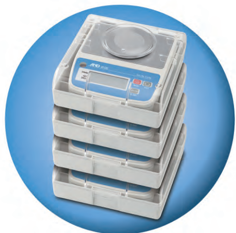
Stackable Carrying Case (Standard)