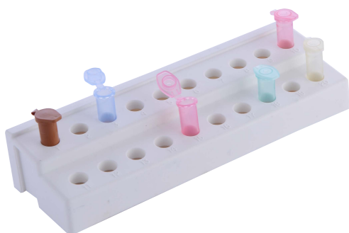
Rack For Micro Centrifuge Tube