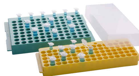
Reversible Rack with Cover