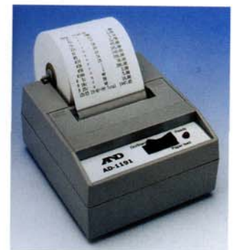
AD-1191 Dot Matrix Compact Printer