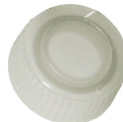
Screw-Caps for Microcentrifuge Tubes with O-Ring , Polypropylene, Natural, 4215R