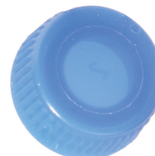
Screw-Caps for Microcentrifuge Tubes with O-Ring , Polypropylene, Blue, 4216R