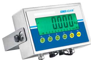
AE 403 Indicator