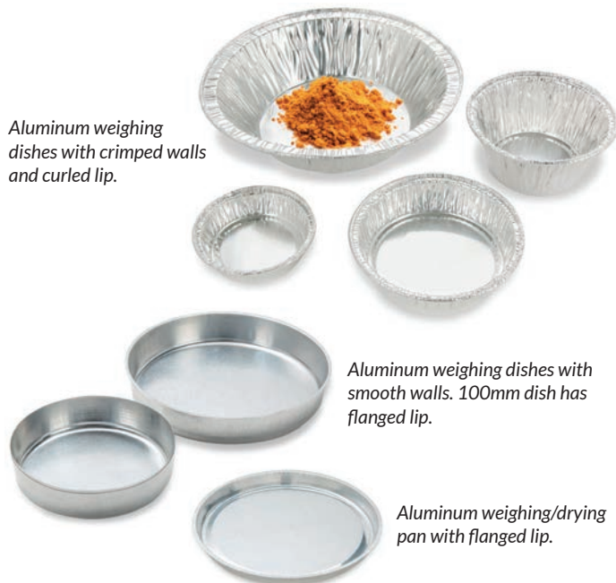
Aluminum weighing dishes with crimped walls and curled lip.