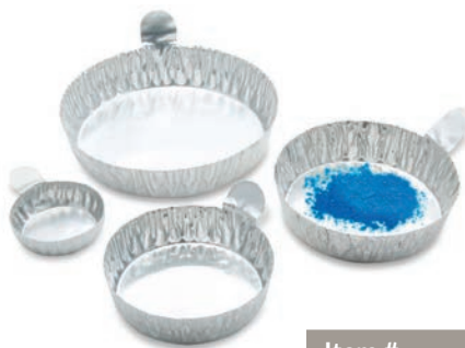
Aluminum weighing dishes with crimped walls and finger grip tab.