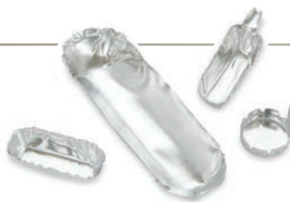
Ideal for microbalances, organic micro elementary and thermal analysis, and pharmaceutical use.