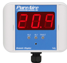
Remote Digital Display