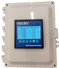
8 Channel Controller for Gas Monitors