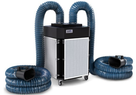
Model 500/550 Dual Python Industrial Fume Extractor

The Model 500/550 Dual Python Industrial Fume Extractor serves as a portable fume control device that requires no external ducting or makeup air. Heavy-duty, locking casters allow mobility providing a great solution for applications with multiple operators that require a powerful respiratory engineering control with easy maneuverability. This system is also available with a single [SS-500/550-PYT-MP1] or quad python hose configuration.