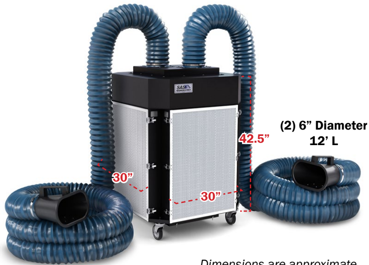
Dimensions are approximate.