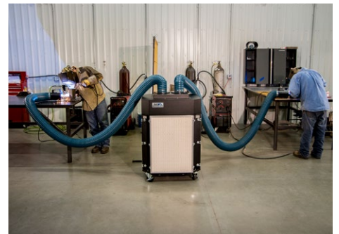
As an option, the 25' python hose provides flexibility for reaching multiple operators in larger welding work areas.