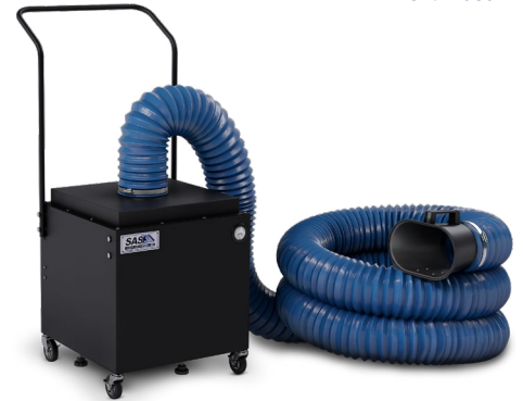
Model 400/450 Python Portable Floor Sentry