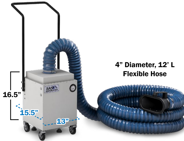
Dimensions are approximate. Shown with optional features.