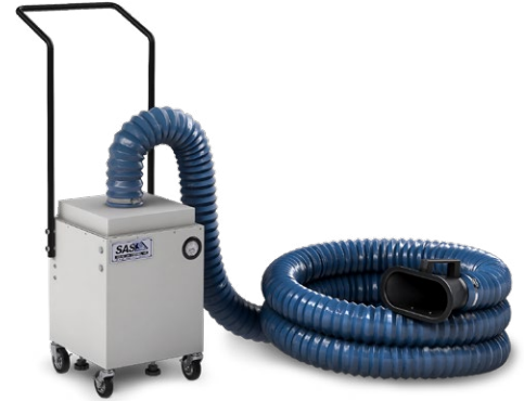
Model 300 Python Portable Floor Sentry

This unit is also available in two larger models [SS-400-PYT and SS-500-PYT] as well as a smaller model [SS-200-MFE].