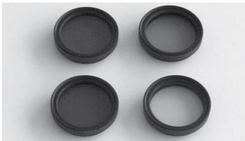
Color filters for spot light