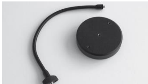
Holding arm for spot light and base stand