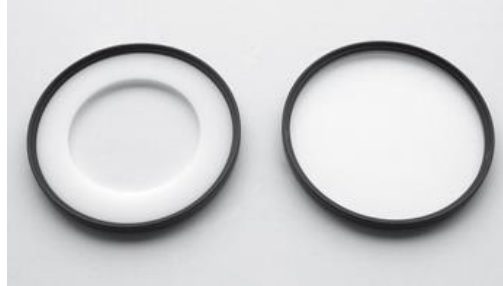
Diffusor and protection window for ringlight