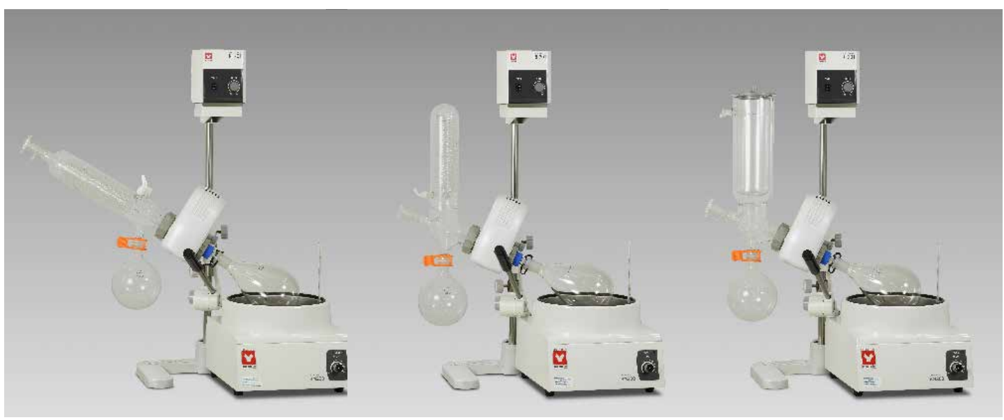
RE-201-200A with optional arm jack (Glassware A)