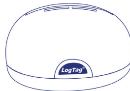
LTI-HID Not Included