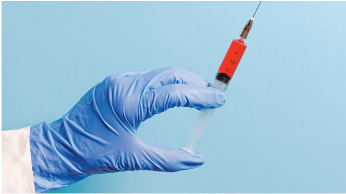
Vaccine & Pharmaceuticals