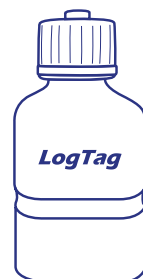
Buffer assembly Not Included (Silica sand recommended for temperatures below -40°C)