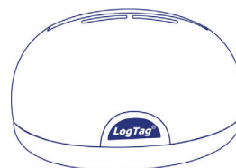
LTI HID Not Included