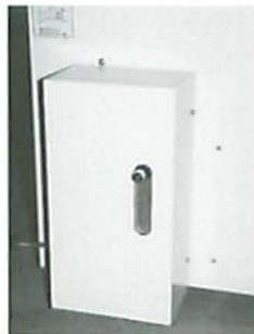
W: Automatic water supply