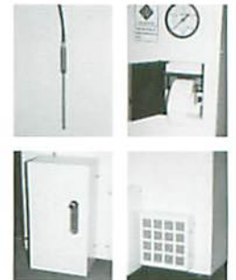
Z: All combined (F+P+W+A)