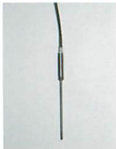
F: Floating sensor