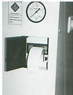
P: Digital printer