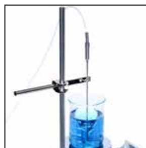
Support Rod and Clamp Kit