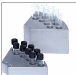
Vial and Test Tube Blocks