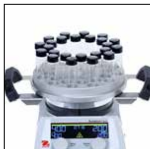
Base Plate and Handles