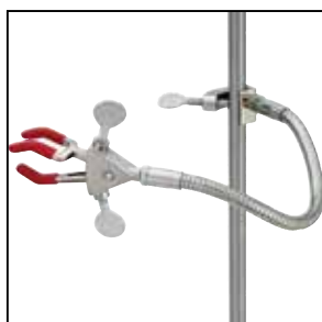
Ultra Flex Support Kit