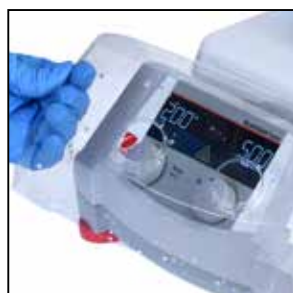
In Use Cover