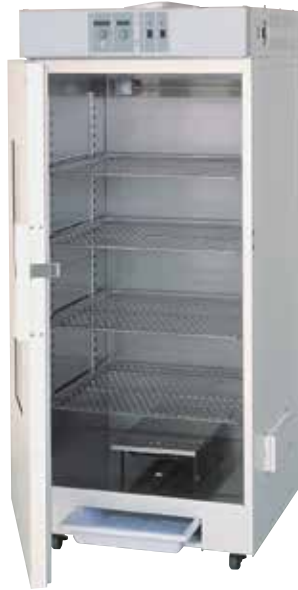
Equipped with exhaust axial flow fan