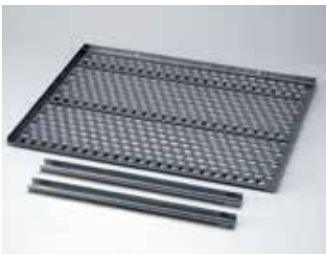
Shelf plate and brackets