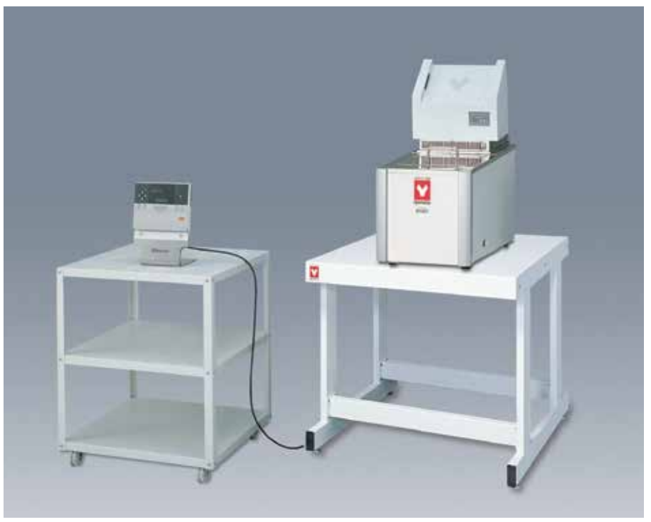
Detachable control panel.

Remote control power source (optional item) needed in case remote control communication cable is longer than 5m