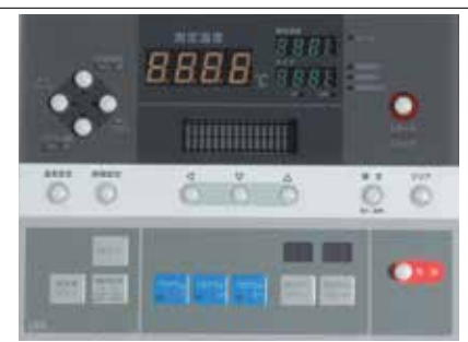
Program controller CR5 model