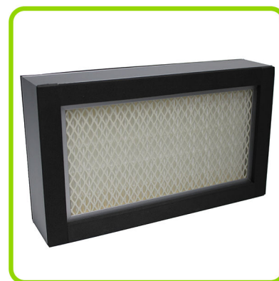
High efficiency, long-lasting HEPA filter included

Ample lighting is provided by an energy efficient LED light source. Up to 3 standard size pipettes are accommodated by the pipette holder integrated within the storage shelf. Pipette tips and small instruments can also be stored away from the main workspace when not in use. Power cables can easily be routed through the access port on the right side of the chamber.