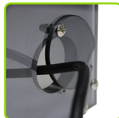
Convenient access port for power cables