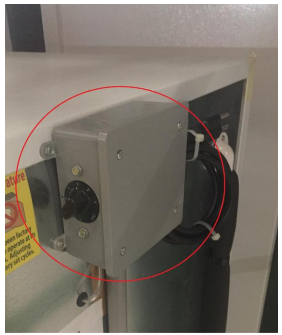
Mechanical Temperature Controller – located in the rear top location of refrigerator or freezer.

After making an adjustment, please allow 8 hours' operation before making a new adjustment.