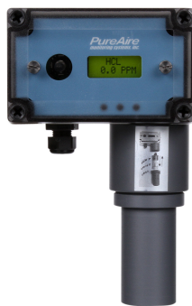
Universal Gas Detector