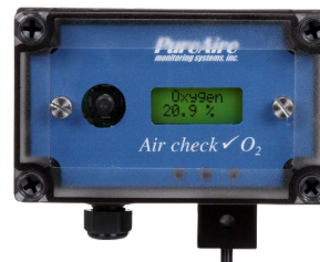
Oxygen Deficiency Monitor