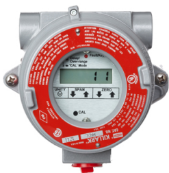
Air Check Explosion Proof Combustible Gas Monitor