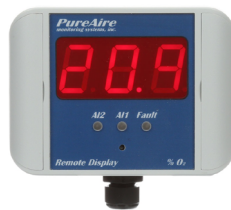
Remote Digital Display