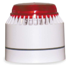
Red Horn/Strobe 24VDC