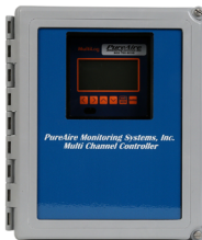
8 Channel Programmable Controller for O2 or Gas Monitors