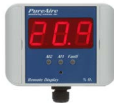
Remote Digital Display