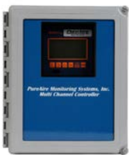
8 Channel Programmable Controller for O2 or Gas Monitors