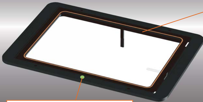
Plate LED Indicator

Ensures more accurate and more reliable thermal control of the sample during the observation under a microscope. Wide product range supports Biotechnology Science and Industries.